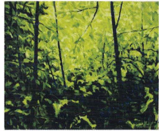
Roger Carlisle, Small Trees in Yellow and Blue , 2006, oil on canvas, 60 x 72 inches