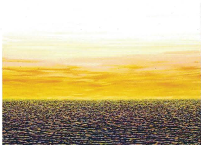
Roger Carlisle , Ocean 2 , 2006, oil on canvas, 48 x 66 inches

Cover Image: Daniel J. Reeves , Blue #3 , 2006, acrylic on canvas, 40 x 30 inches Back Image: Roger Carlisle , Ocean 1 , 2006, oil on canvas, 48 x 66 inches