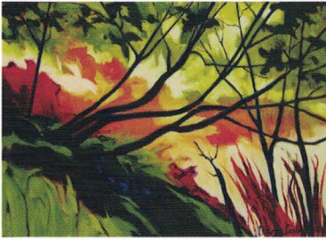
Roger Carlisle, Embankment and Trees , 2006, oil on canvas, 48 x 66 inches