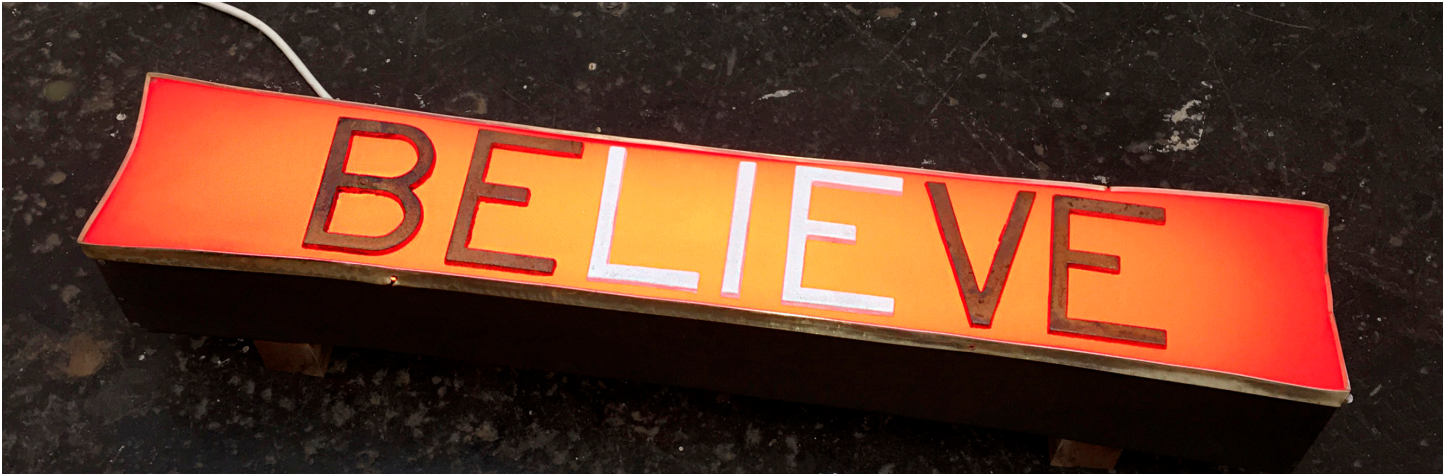
Greely Myatt, BELIEVE , 2016, neon, iron, plastic, sheet metal and walnut, 8 x 37 x 7 inches